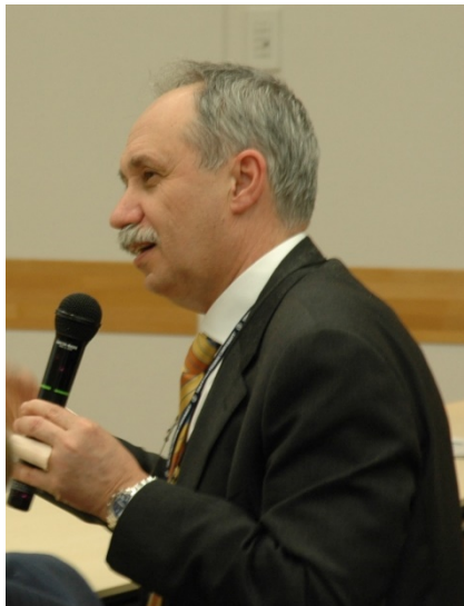
2008 ISWE3 in Tokyo