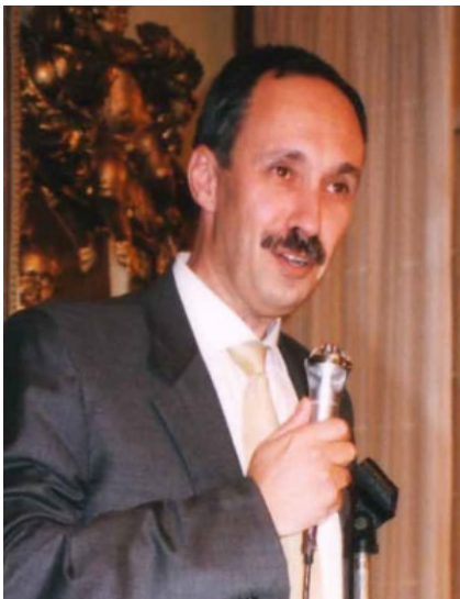
1997 EACWE2 in Genova

He seemed to have hastened to his death, leaving this great classic for us.